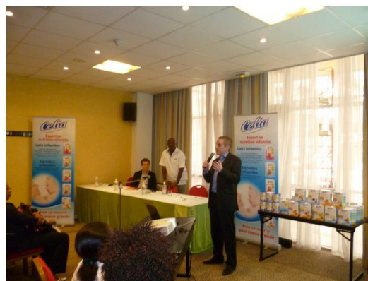
In the Ivory Coast, Celia was launched with a presentation to health professionals at a hotel.

Similarly, Novalac violated the Code by promoting its products to the public in Bosnia and Herzegovina, Croatia, France, Lebanon, Malaysia and Slovenia. Other Code violations in the form of promotion of products to health professionals were reported during a conference in London and through other initiatives across the Middle East.