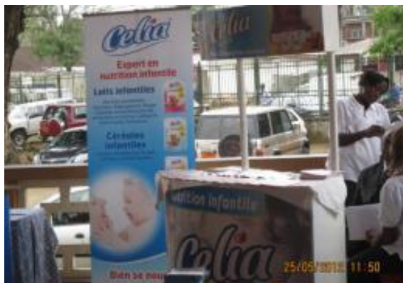
In Cameroon Booths and banners proclaiming Celia as experts in infant nutrition can be seen in a fair to commemorate International Midwives Day.

These two companies based in France have also an important responsibility in their systematic violations of the Code in several countries. In particular, the Lactalis Group , comprising many other companies acquired over the years, violated the Code provisions for what concerns promotion of breastmilk substitutes to the public in Cameroon and Lebanon, and for what concerns promotion to health professionals in the Ivory Coast, UK and Vietnam. 72